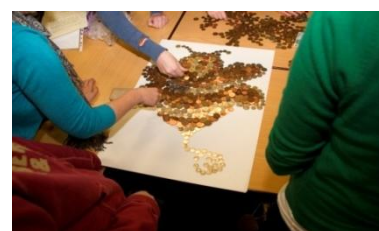
The Winning Sculpture: Evenlode